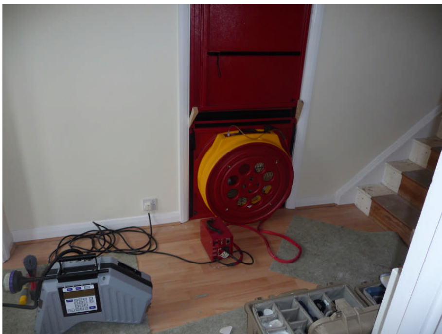
Installation of Negative Pressure