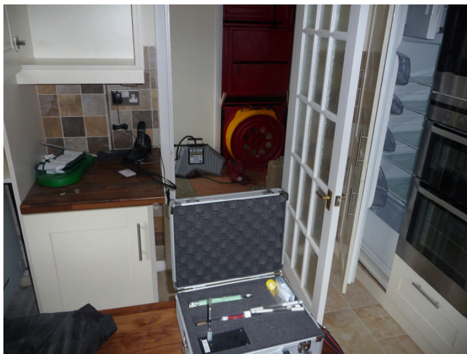
VOC air sampling