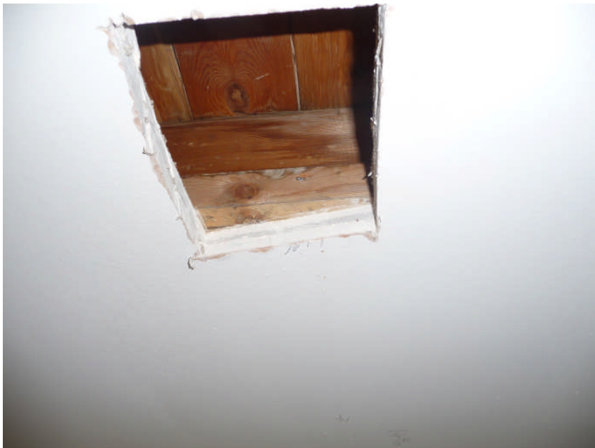
Cut hole to ceiling in kitchen to expose joists