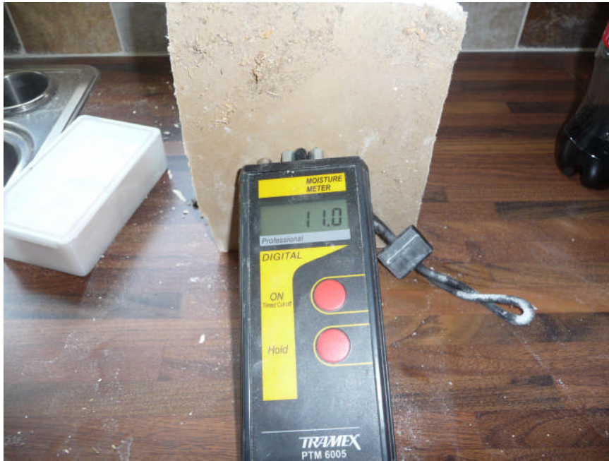
Photo 4 Bottom layer plasterboard showing moisture content