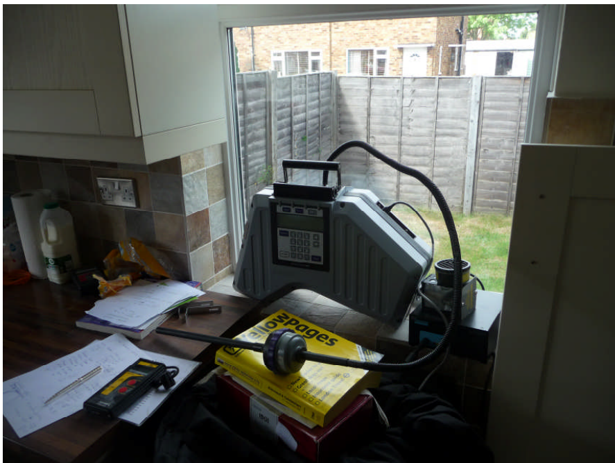
Foxboro Miran Air Infra Red analysis